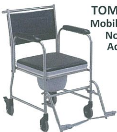
TOM TCM691S Mobile Commode Non-Height Adjustable