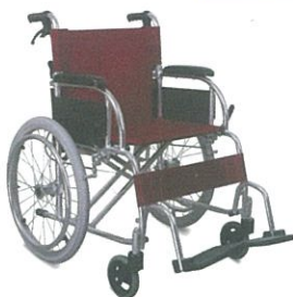
TOM TAW878LAJ Lightweight Non-Detachable