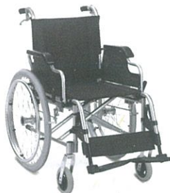
TOM TAW908LJ Lightweight Detachable