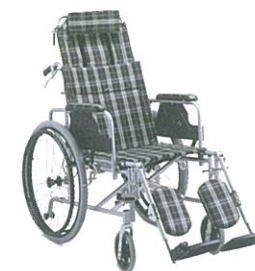
TOM TRW954LGC Reclining Lightweight Detachable