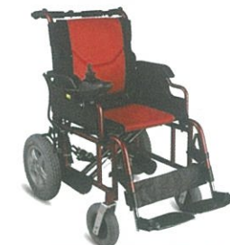
TOM TEW110LAE Electric Powered Wheelchair