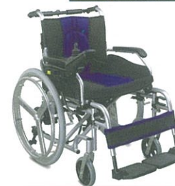
TOM TEW107LAEFP1 Electric Powered Wheelchair