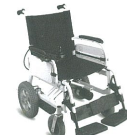
TOM TEW110LF1 Electric Powered Wheelchair