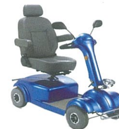
TOM TEW140 4 Wheeled Motorized Scooter