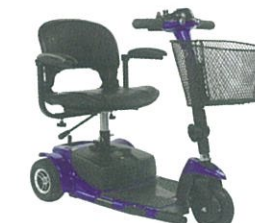
TOM TEW037 3 Wheeled Motorized Scooter