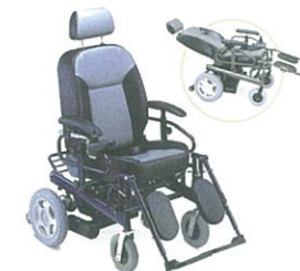
TOM TEW112LGC Premium Range Motorized