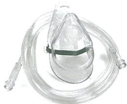
Accessories Oxygen Mask with Tubing