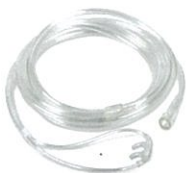
Accessories Nasal Cannula