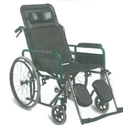
TOM TRW954GC-46 Reclining Heavy Duty Detachable