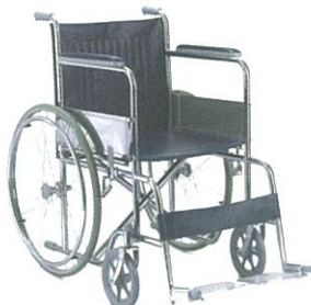
TOM TSW809 Heavy Duty Non-Detachable