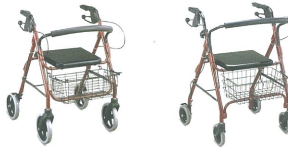
TOM TWA966LH Height Adjustable (Dual Rear)