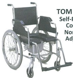
TOM TCM683L Self-Propelling Commode Non-Height Adjustable